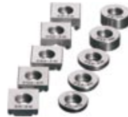
Test attachments for curved surfaces