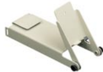
Instrument carrier and prop-up stand