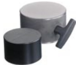
Certified hardness reference blocks