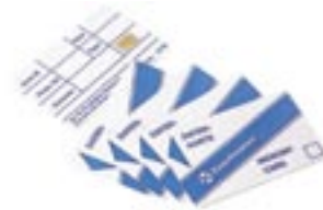
Memory cards for storing measurement and calibration settings