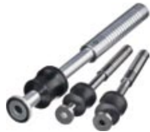
Impact devices for different applications