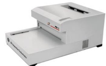
Film Digitizer FS50