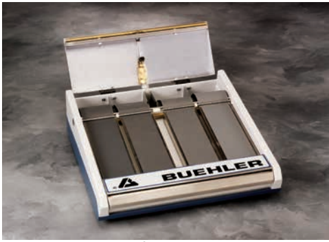
Covered storage area for abrasive rolls provides protection and permits rapid changing of grinding surfaces when required.