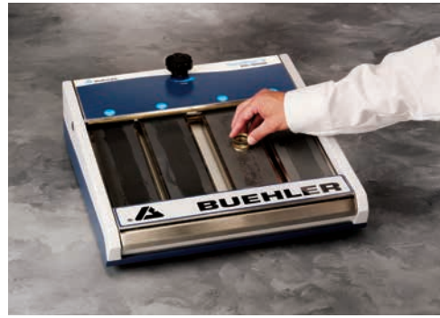
The HandyMet® 2 provides a compact, self-contained, four-stage grinding station to accommodate a variety of sample preparation applications.