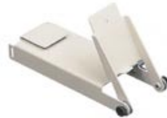
Instrument carrier and prop-up stand MIC 1040