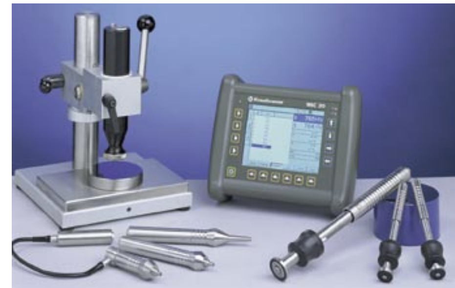
"Hardness testing as a twin pack": The MIC 20 with a selection of rebound impact devices and UCI probes, as well as with the quick support including motorprobe.

The MIC 20 makes for example the calibration easy for you. The setting parameters are then simply filed and recalled by pressing a button or by a "click" in the corresponding application case.