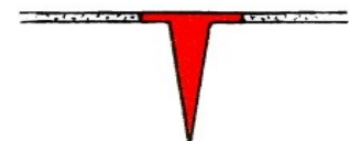
4. step surface defect after developing with red indication