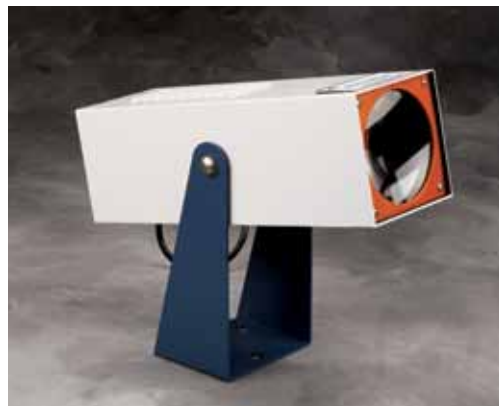
The 30-8050 PetroVue® Thin Section Viewer is designed for monitoring section thickness and uniformity during the grinding/lapping processes. It provides a polarized light source.