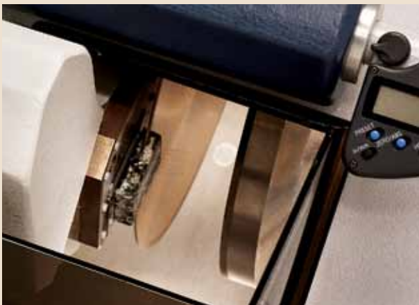
Glass slide mounted specimen resectioned on the diamond cutting blade. The grinding wheel (right) reduces the specimen thickness without having to remove the specimen after resectioning.