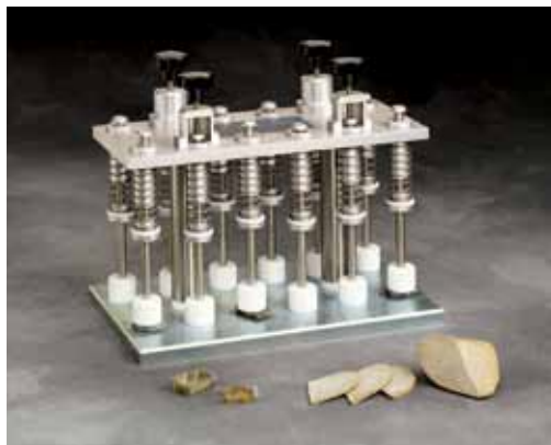
The 38-1490 PetroBond® Thin Sectioning Bonding Fixture is designed to accurately control the thickness of the bonding media between the specimens and glass slides.