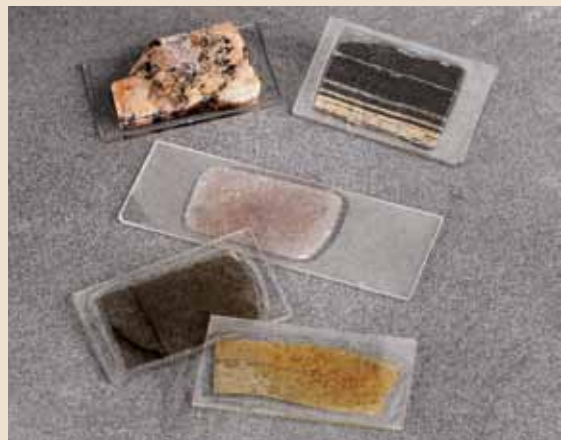
Mineral samples re-sectioned and thinned to 30µm.