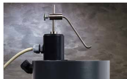
The tank mount serves as a platform for the specimen. Easily exchangeable masks allow the preparation of differently sized specimen-areas.