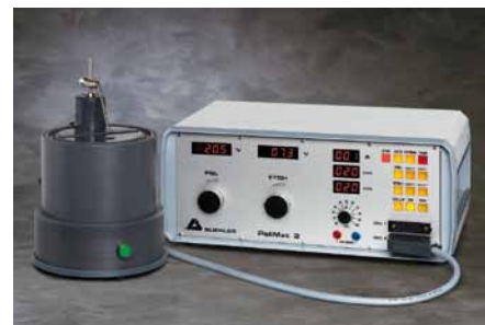
The PoliMat 2 consists of two components, the controller and power supply unit and the electrolytic cell. The controller is built into a robust metal housing. Preparation parameters can be adjusted separately.

Influence of current density and voltage on the sample. The efficient polishing range is marked grey. At low voltage the sample will be etched. Higher voltage results in vapor locks within the electrolyte and irregular current flow which itself leads to pitting.