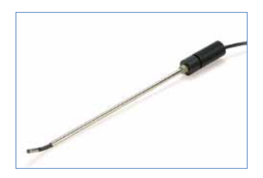
Rigidizers and Grippers