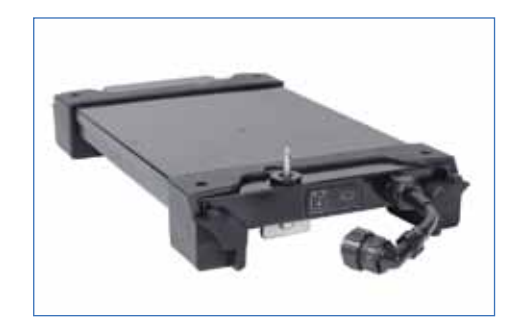
One- or two-hour capacity battery/UPS (uninterruptible power supply)