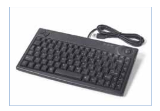
USB® keyboard with trackball