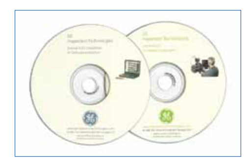
Application software (Menu Directed Inspections and Report Generators