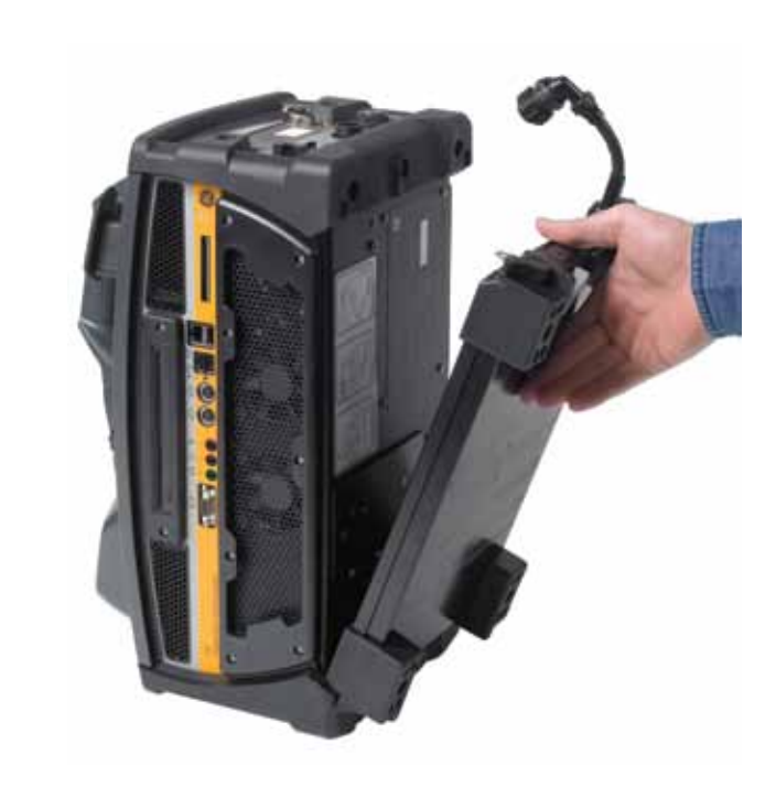
System with integrated battery