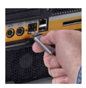
USB 2.0 Port Save images to a flash drive for fast data transfer

With new, versatile features to speed the inspection process, the XLG3 VideoProbe system dramatically reduces inspection and post-inspection time and increases productivity. Bright, sharp inspection images jump from the high-resolution screen for faster defect identification and can be routed to remote offices for critical, time-sensitive evaluations and improved decision making on the spot. Create final inspection reports on-board and immediately write to DVD to increase efficiency.