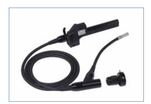
Borescope adapter for rigid and flexible borescopes and highmagnification lenses