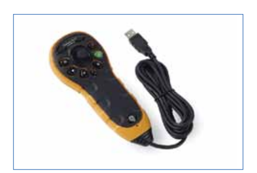
Remote control with joystick