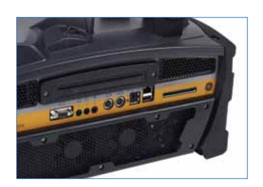
CompactFlash® card slot for external memory