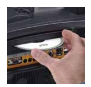
DVD/CD Drive* Read or write inspection data in real-time to the on-board DVD/CD drive