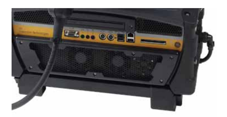
One- or two-hour capacity battery/UPS facilitates confined space work.