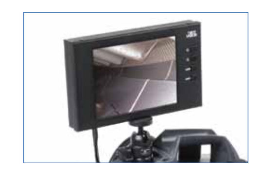
External SVGA LCD monitor