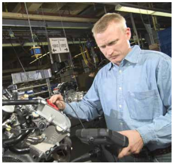
Inspect valve seating through the spark plug port