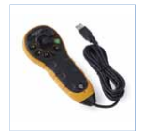
Remote Control* Remote control with joystick