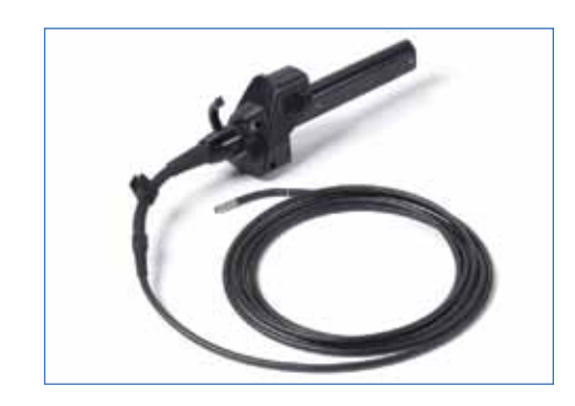
QuickChange™ spare probes in 3.9 mm, 5.0 mm, 6.1 mm, 6.2 mm with working channel and 8.4 mm diameters in lengths of 2, 3, 4.5, 6, 8, and 9.6 meters