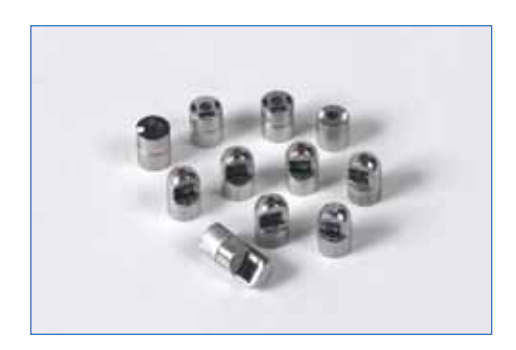
Full range of optical tips including 3D phase, stereo and shadow measurement with a NIST traceable verification block