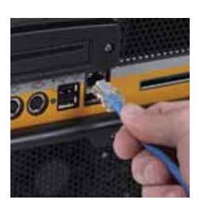
Ethernet Port Connect to the Internet* to view product or maintenance manuals or send report and image data via e-mail